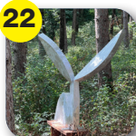
22 Bunny for Nothing Craig Snyder Main St & 1st Ave N (SW) Aluminum 2023 $8,800