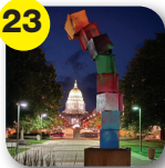
23 Drip Edge Craig Snyder Library Square Painted Steel 2018 $6,200