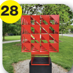
28 Cherry Sunghee Min Main St & 3rd Ave S (NE) Welded Steel and Paint 2020 $11,000