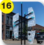
16 Full Sail VI John Kamrath Luce Line, West River Park Stainless Steel, Aluminum 2022 $6,500

Use the QR code to visit our website and vote for the People's Choice Award! www.hutchinsonpublicarts.com