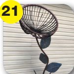
21 Majestic Delight Vic Rouleau Historic Depot/Farmer's Market Rustic Metal 2023 $3,500