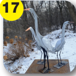
17 3 Amigos Judd Nelson Luce Line, Riverside Park Forged Steel 2021 $7,500