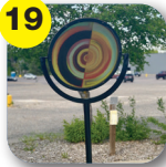
19 Magnify Kirk Sesse Main St & 1st Ave N (NE) Steel, Acrylic 2025 $7,500