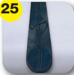
25 Rhythm Gedion Nyanhongo Main St & 1st Ave S (SW) Hand-Carved African Spring Stone 2024 $16,000