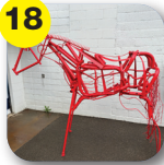
18 Thinker Victor Yopez Luce Line, Law Enforcement Park Welded Metal, Found Objects 2019 $9,000