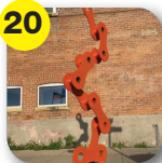
20 Released Jim and Ryan Pedersen Luce Line, Pedestrian Bridge Welded Steel and Powder Coated 2024 $12,500