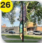
26 Pluma Sculptura (Feather) Kirk Sesse Citizens Bank Park Steel, Printed MDO Board 2019 $7,500 Sponsored by Citizens Bank & Trust