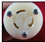
50/30 Amp Twist