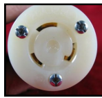
50/30 Amp Twist