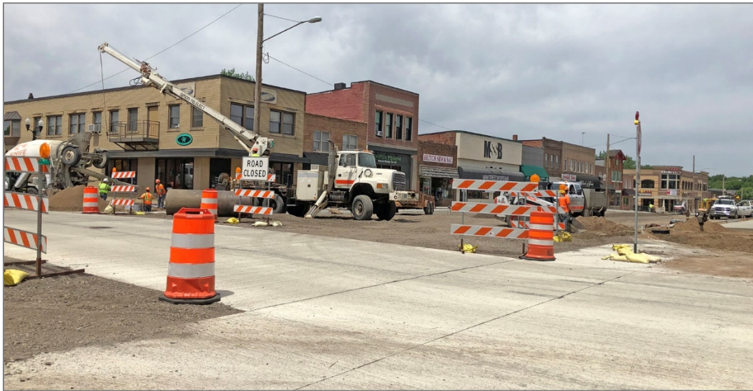
Photo above: the intersection of Highway 15 and Washington Avenue is open to cross traffic.