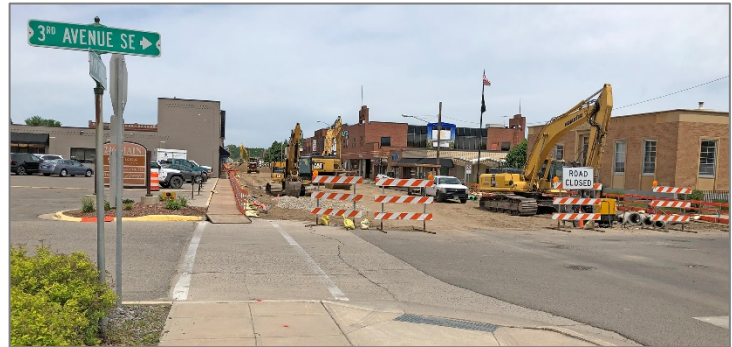
Photo above: currently, reconstruction work is in Stage 3, which is closed to all traffic between Washington Avenue and 3 rd Avenue South.

Image at left: the map shows the two different work areas associated with the Highway 15/Main Street project: the reconstruction part of the project is highlighted in red, while the resurfacing part of the project is highlighted in orange.