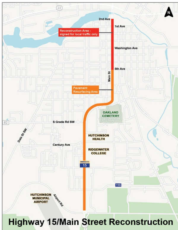
Image at left: the map shows the two different work areas associated with the Highway 15/Main Street project: the reconstruction part of the project is highlighted in red, while the resurfacing part of the project is highlighted in orange.