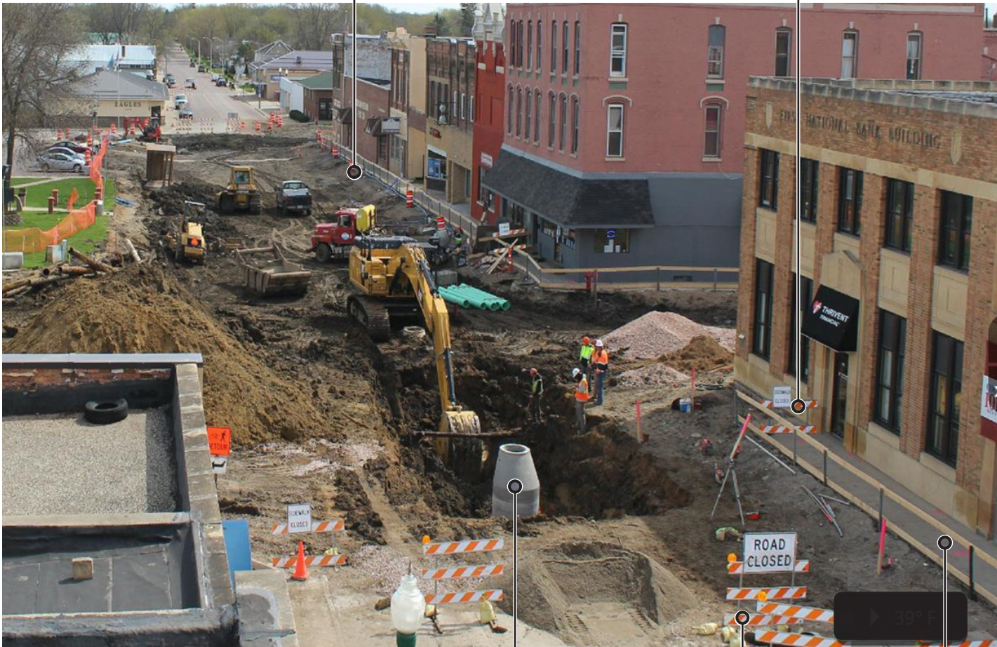
Sanitary Sewer & Water Main Installation