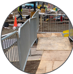
Temporary sidewalk when needed

Construction is planned for 2020 and will include roadway and underground utility removal and reconstruction.